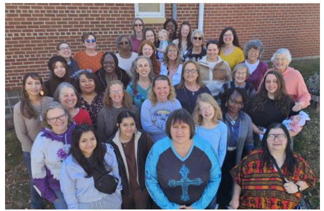
Some of the attendees of the "Committed to Christ" workshop - Rochester CoC - October 26, 2024

Forty ladies from two congregations in the Twin Cities gathered for the weekend workshop hosted by the Rochester Church of Christ in Minnesota.