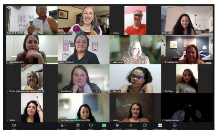
Some of the attendees of the virtual class

languages, and cultures, we are women that face many similar challenges. This event was also the official kickoff of Committed to Listen: Forty Days of Dedication.