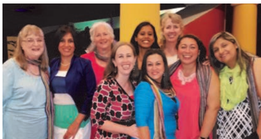
Current and former Venezuelan workers, in Guatemala