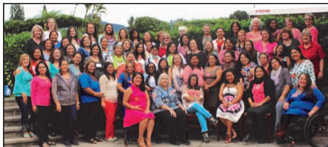
Conexiones Women's Renewal Retreat, Guatemala

and free time provided a balanced schedule during the five-day retreat.