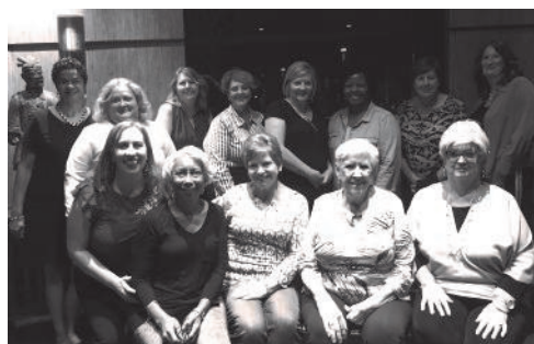
Twisted Sisters in Baton Rouge