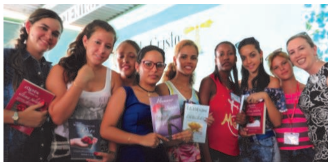
Young Cuban women who won IRSM Bible study books as door prizes to take back to local church

Please be in prayer for the ways in which God is leading us to continue to encourage and equip our Cuban sisters! A follow-up trip is planned next year, in April.