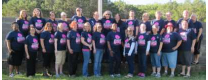
Ret’s Retreat is a nonprofit promoting girls retreat programs

As a women’s retreat in Texas , a state with a large Hispanic population, part of IRSM’s role at