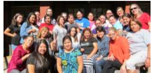
Iglesia de Cristo Springdale women

basis for the weekend retreat with the Hispanic group of women from Springdale, Arkansas, in September.