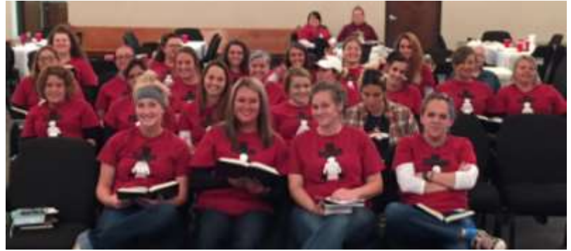
John 3:17 Ministry Women at Ladies Day