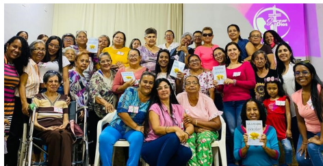
Venezuelan women from two congregations finish Llamada a escuchar

“¡Gracias!” videos, are a glimpse of the depth of relationships growing with God and with one another. These women are grateful for you, your prayers, your support, and, in many cases, the small group Bible study books as an instrument through which they can grow deeper.