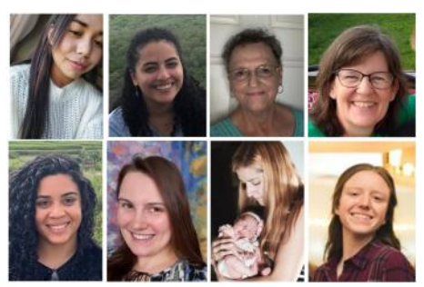
Find the HIStories of these ladies at IronRoseSister.com, under "Blog."

Additionally, when women are equipped to dig deeper into the Word, they are encouraged by the big picture story of the Bible, as well as empowered to recognize God's living and active hand at work today.