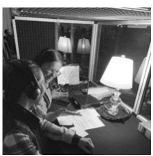
Sisters interpreting the WOH Conference into Spanish

events. Contact us if you'd like more information info@ironrosesister.com