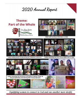
2020 Annual Report summarizes the God stories from a challenging and blessed year (available online)