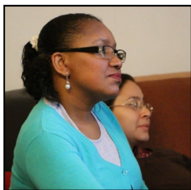
Attentive listeners in Buenos Aires

Thank you for your prayers and your financial support to help make this possible! God is using you to bring about the stories in this