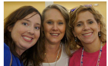
Ladies at Enterprise Blvd. event, Lake Charles, LA