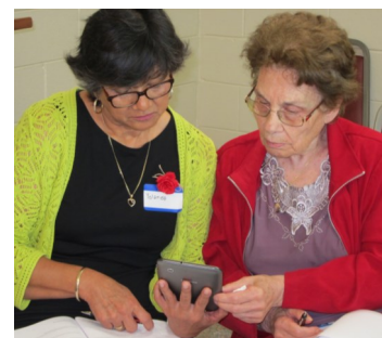
Women of all ages participated in the Hispanic Cole Mill Road CoC event

Don't forget to select IRSM as your charity of choice.