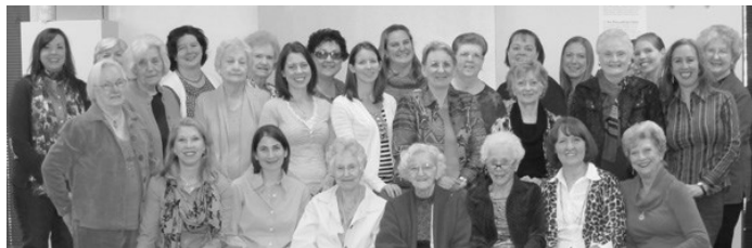
Memorial Church of Christ, Houston, TX (above)

So, grab a friend, meet at a coffee shop, invite some sisters over for coffee, and start a Human AND Holy study today!