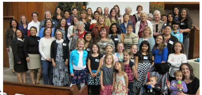
English & Spanish group at Northwest Church of Christ's Ladies' Retreat