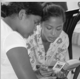
Hungry for the Word and applying the 'Common Threads' to Galatians 5:16-26 in Caripe, Venezuela.