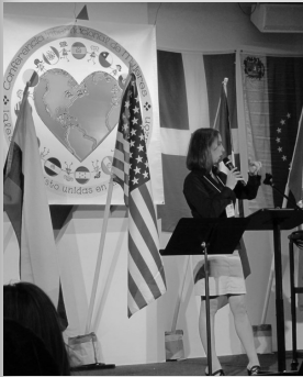
Over 400 women from 14 countries gathered at the International Women's Conference in Houston, Texas.