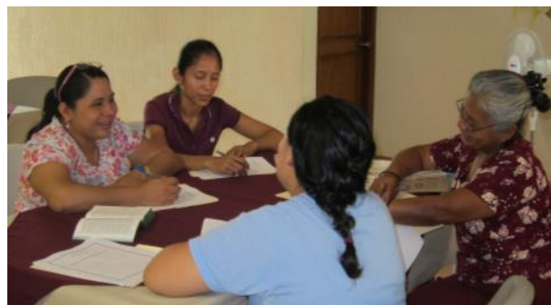
Women at Clínica Ezell, Guatemala, in small group time