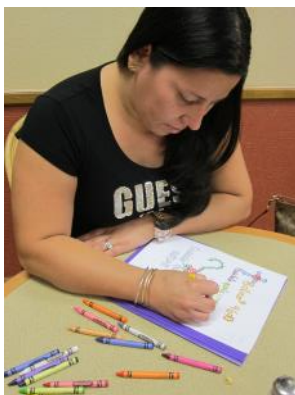
Meditating on Psalm 46:10