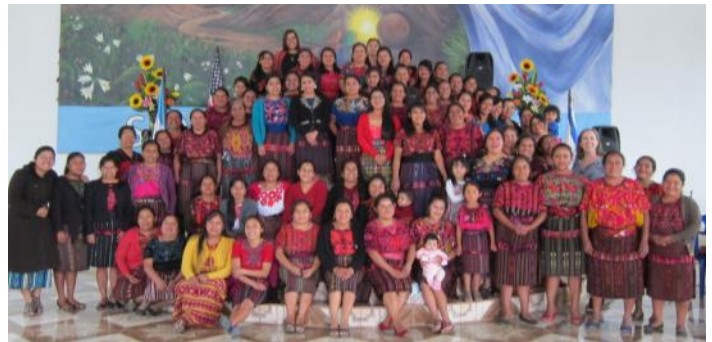
More than 70 Quiche sisters gather to learn from Philippians , in Chichicastenango, Guatemala

What a joy to reconnect with women who attended last year, and meet a number of new sisters. Women leaders from fifteen congregations