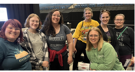
Singles Class attendees

We are grateful for this opportunity to reach more women through this partnership with WWWG.