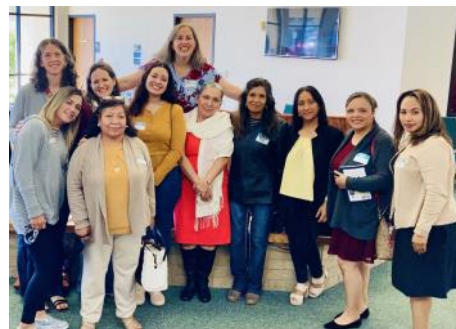
Sisters from Siempre Familia Church of Christ

We are grateful for how these things came together for the bilingual event, hosted by the Woodland West Church of Christ in Arlington, TX in partnership with other local congregations.