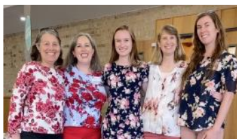
IRSM team and volunteers

We are grateful for how these things came together for the bilingual event, hosted by the Woodland West Church of Christ in Arlington, TX in partnership with other local congregations.